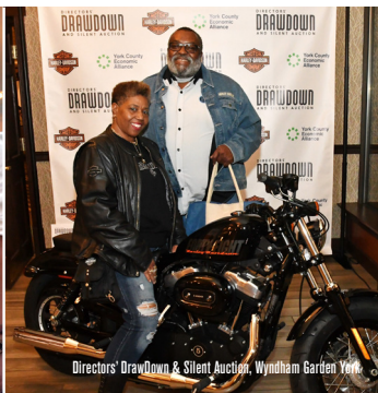
Directors' DrawDown & Silent Auction, Wyndham Garden York