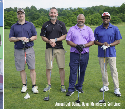
Annual Golf Outing, Royal Manchester Golf Links

✓ 1,013 members 68,122 employees 1 out of every 3 York Countians in the workforce is a member of the YCEA