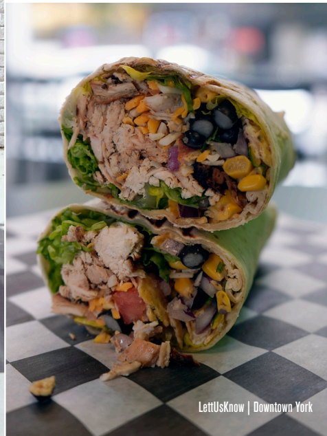
LettUsKnow | Downtown York

Showcased 100 businesses through 7 PUBLICATIONS