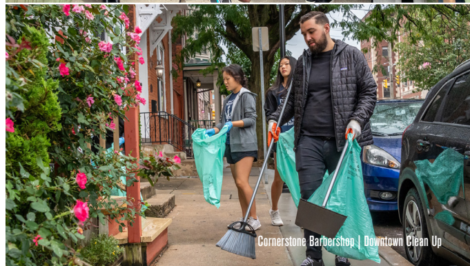
Cornerstone Barbershop | Downtown Clean Up