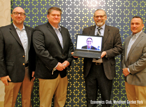
Economics Club, Wyndham Garden York