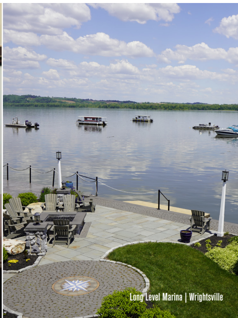
Long Level Marina | Wrightsville