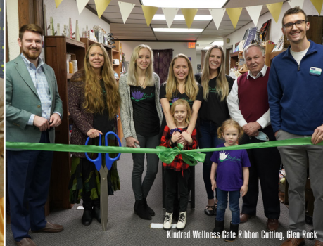
Kindred Wellness Cafe Ribbon Cutting, Glen Rock