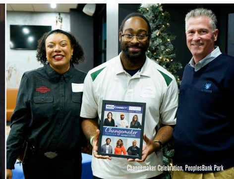
Changemaker Celebration, PeoplesBank Park