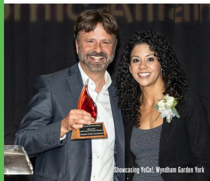
Showcasing YoCo!, Wyndham Garden York

Hosted 10 virtual York Story Slam events and heard 80 true, personal stories from volunteer storytellers who shared with about 600 attendees