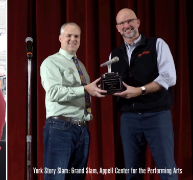
York Story Slam: Grand Slam, Appell Center for the Performing Arts