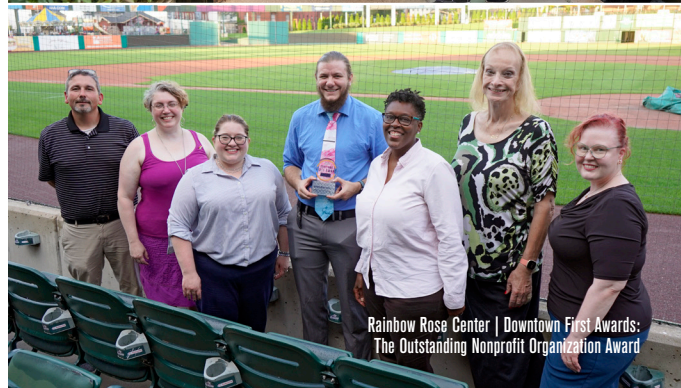
Rainbow Rose Center | Downtown First Awards: The Outstanding Nonprofit Organization Award