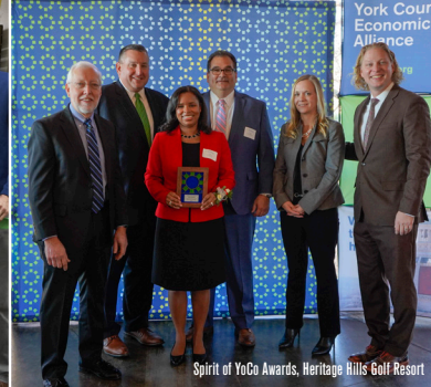
Spirit of YoCo Awards, Heritage Hills Golf Resort