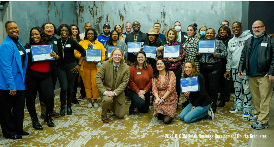
2021 BLOOM Small Business Development Course Graduates

Helping small businesses bloom through education, capital, opportunity, and inclusivity.