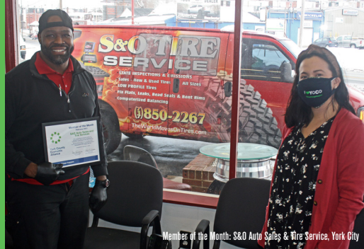
Member of the Month: S&O Auto Sales & Tire Service, York City