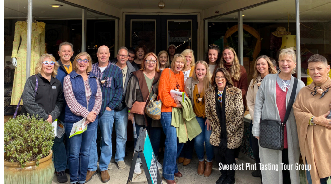
Sweetest Pint Tasting Tour Group

HOSTED DOWNTOWN FIRST AWARDS honoring over 40 businesses, individuals, and organizations